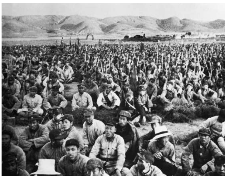
In 1936, the First Army Group of the Red Army in Ningxia.

Still later, Snow observed that the Anti-Japanese National United Front demonstrated a profound cohesiveness and appeal, unlocking the infinite might latent within hundreds of millions of people and laying a rock-solid foundation for the ultimate victory of the war. American journalist Anna Louise Strong described it thus: "Yet, under the pressure of this aggression, the Chinese people began to awaken, to unite, and to develop the concept of a nation." ② The consciousness of a Chinese national community, erupting at a moment of existential crisis, miraculously galvanized a then-fragmented, weak, and defenseless China into a Great Wall of flesh and blood, where millions acted with one mind to resist foreign aggression.