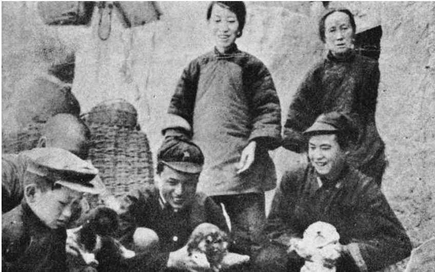
Red Army soldiers and local peasants in the Northern Shaanxi Base Area, 1937 (archival photograph).

In Red Star Over China , Snow captured such a scene: when the Red Army marched through a village, a Hunan blacksmith's apprentice nicknamed "Iron Tiger" resolutely laid down his bellows and pans. Bearing no luggage, he rushed to enlist, wearing nothing but a pair of straw sandals and a pair of trousers. ③ According to British journalist James Bertram, along the route of the Long March, the Red Army had attracted and taken in sons and daughters of workers and peasants from over a dozen provinces who wanted to devote themselves to the fight to save the nation from Japanese aggression. Bertram remarked that this army was more truly representative of the Chinese people than any other army. ④