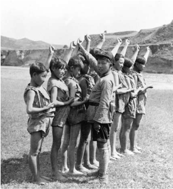
The "Little Red Devils" are playing games.

What power on earth sustained these people, enabling them to maintain such an incredible, unyielding fighting spirit while living on the brink of despair? Mao Zedong told Snow that "everyone in the Soviet (the Communist-led revolutionary base area) was ready to fight for his government against his oppressors because every person was voluntarily and consciously fighting for his own interests and what he believed to be right" ① . A Red Army soldier told Snow that "here everybody fights to help the poor, and to save China" ② .