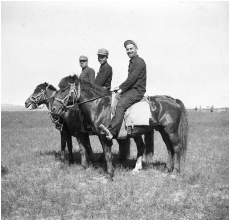
Edgar Snow (right) on his reporting trip in northern Shaanxi, 1936 (archival photo).

In 1936, American journalist Edgar Snow broke through tight blockades and ventured deep into the Shaanxi-Gansu-Ningxia Revolutionary Base Area, where his first-hand observations gave rise to Red Star Over China . After the founding of the People's Republic of China, he visited the country three more times, documenting its development and transformations.