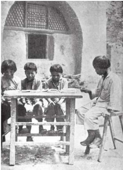
"The poor must read too" (Illustration from the 1938 edition of Red Star Over China )

Before heading to Yan'an, he was brimming with curiosity about its "Red culture". "What were Chinese 'Red factories' like? What was a Red theater? What about public health, recreation, education, and 'Red culture'?" ② ...Carrying with him these "unanswered questions", Snow witnessed in Yan'an that the CPC attached paramount importance to education, eradicating cultural illiteracy through literacy campaigns, mass propaganda, wall newspapers, and theatrical performances. He observed a cultural experiment that sought to dismantle traditional ties based on bloodlines and geography in order to forge a new type of "comradely" relationship. He regarded this as a highly efficient organizational culture through which the CPC had constructed a new "world of meaning" among an impoverished and illiterate populace.