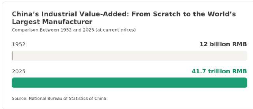
Chart: Comparison of China's Industrial Value-Added in 1952 and 2025

first in world ranking for 15 consecutive years. ① "Made in China" is comprehensively advancing toward "Created in China" and "Intelligently Manufactured in China", injecting powerful momentum into China's high-quality social development. Since 2010, China has consistently maintained its position as the world's second-largest economy. In 2025, China's GDP exceeded 140 trillion yuan for the first time. Against a backdrop of overall pressure on global economic growth, China's average annual contribution to world economic growth has remained at around 30 percent for five consecutive years. ②