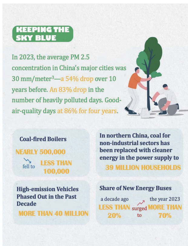
Figure 2. Improvements in China's Air Quality

In 2023, the average PM 2.5 concentration in major cities across China was 30 micrograms per cubic meter, representing a 54% reduction compared with that of a decade ago. The number of days with heavy pollution dropped by 83% and the proportion of days with good air quality remained above 86% for four consecutive years. China has become the world's fastest-improving country in air quality. China has continued to move ahead with the prevention and control of noise pollution to address the environmental pollution problems around the people. The Ministry of Ecology and Environment, together with 15 departments, issued the Fourteenth Five-Year Plan of Action for Noise Pollution Prevention and Control -the first action plan in this field. It has pushed for the construction of more than 4,000 automatic monitoring stations in 338 cities at the prefecture level and above, with 280,000 industrial enterprises incorporating noise into their discharge permit management. There was supervised handling of more than 1,000 noise cases which the public felt strongly about, benefiting hundreds of thousands of people. In 2023, the nation's acoustic environment functional zones had an 87% nighttime compliance rate, an increase of 15 percentage points compared with the rate of ten years earlier.