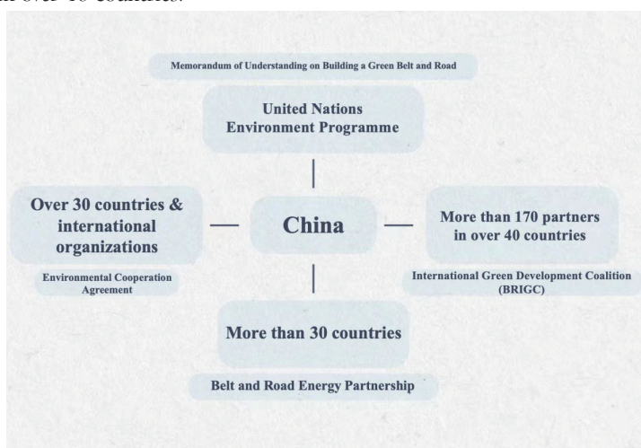
Figure 6. Main mechanisms for green multilateral cooperation under the Belt and Road Initiative

General Secretary Xi Jinping stated: Addressing global climate change is impossible without China and its people. China and its people have made invaluable contributions to...responding to global climate change. ① For a long time now, China has consistently lent its support to other developing countries, especially the small island developing states (SIDS), least developed countries, and African countries in their climate response through building low carbon zones, implementing mitigation and adaptation projects, and organizing capacity building exchange workshops. As of November 2024, China had signed memorandums of understanding on South-South cooperation against climate change with 42 countries and held over 300 capacity-building training courses which offered over 10,000 training placements to over 120 other developing countries. Under the Belt and Road Initiative, China has implemented the South-South Cooperation Plan to combat climate change, forged energy cooperation partnerships, and established the Green Belt and Road Initiative Center (BRIGC) with more than 170 partners from over 40 countries.