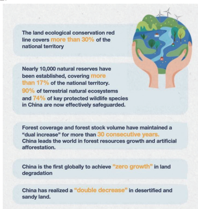
Figure 5. China's Endeavor in Ecological Conservation and Restoration Saihanba Mechanical Forest Farm in Hebei Province has fought tirelessly for de-

For more than three decades, China has maintained a consistent "dual growth" trajectory in forest coverage and forest stock volume, establishing the country as the global leader in forest resource growth and afforestation. Internationally, China led the world in achieving "zero growth" in land degradation, with reductions in both desertified and sandy regions, playing a positive role in reaching the global objective of zero net land degradation by 2030. Since 2000, China has remained a significant player in global greening efforts, contributing approximately one-fourth of the world's additional greened areas.