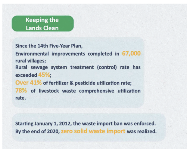
Figure 4: China's Battle for Clean Lands

Key initiatives include adjusting the agricultural input structure, reducing chemical fertilizer and pesticide use, increasing the share of organic fertilizer use, and improving the recycling system of used agricultural plastic film. An operation to rectify the rural living environment has been carried out in a sustained manner. Since the launch of China's 14th Five-year Plan, 67,000 additional villages have completed environmental upgrading, the rural sewage treatment (control) rate has exceeded 45%, the fertilizer and pesticide utilization rates have surpassed 41%, and livestock and poultry waste recycling rates have reached 78%.